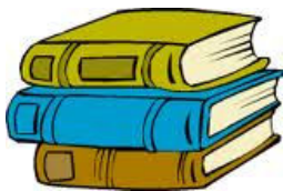
Check Out Our Youth and Adult Programs

Patrons at the DeWitt District Library may opt to expedite their check-out using the library's new self-check kiosk. The user-friendly kiosk's computer screen provides patrons with prompts leading them through the check-out process. Simply scan your library card, scan your material, print your receipt and you can be on your way!